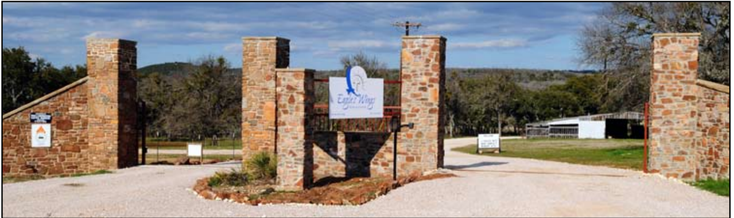
New Entry and Signs Completed