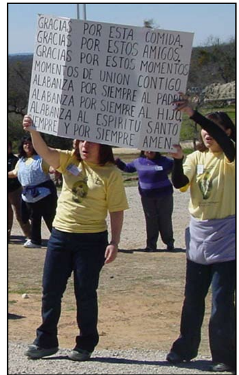
Western Deanery Women ACTS singing for their supper

It is my hope that you share with me the passion I have to someday in the near future have a dedicated chapel here at Eagle's Wings for our liturgies and adoration. Won't you help me bring in the Good Soil?