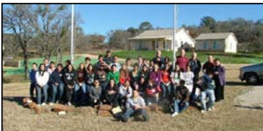
St. Mary's Wimberly Confirmation Retreat