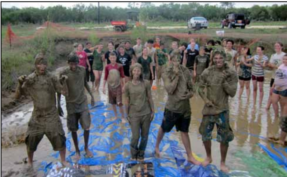
Diocese of Austin Crosstraining Retreat

We are truly blessed. I think I'll go take a nap!