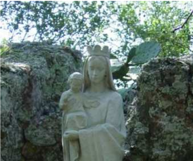
The Marian Grotto makes for a wonderful prayer & meditation area.

overnight service weekend. These wonderful men put steps on the back deck of Eagle's Nest and engineered and constructed the deck's porch roof. Meanwhile the women folk assembled a bench for the Marian grotto and cleared the area around our new statue of Mary.