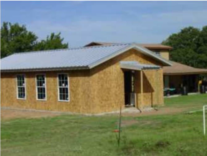
The bunkhouse under construction sits next door to Eagle's Nest.

Eagle's Nest was completed in late June and has been used for 3 retreats thus far. Our next step is to make the sleeping arrangements equal the meeting space so we have started construction of the bunkhouse. When complete we will have an additional 20-22 bed and 2 additional bathrooms so we can easily handle 40 people at Eagle's Nest.