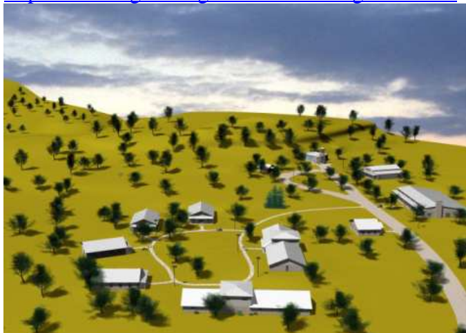
Retreat Center Layout – Sleeping quarters on the left with meeting, dining and chapel on the right.

Thanks to our volunteer Engineering/Architect Team lead by Don Collier our Master Plan is almost done. The big item left is to finalize the detail architectural and engineering drawings. Our first step once the drawings are complete is to start installing the infrastructure items such as roads, water, waste water and electric to the main campus site. To view the artist renderings go to Plans under the Eagle's Wings Retreat Center website: http://www.eagleswingsretreatcenter.org/Plans.htm