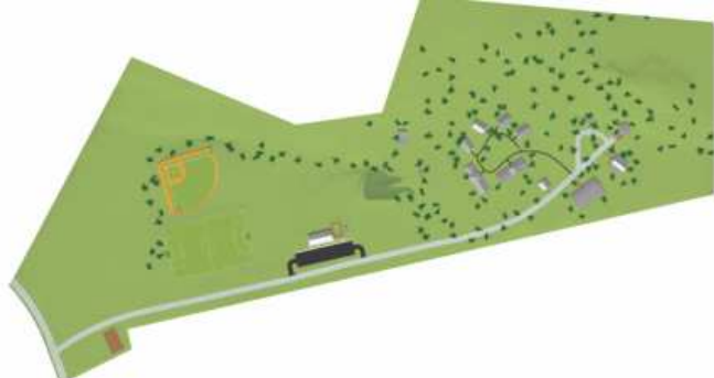
Site Layout shows athletic fields and pavilion to the left and main campus to the right.