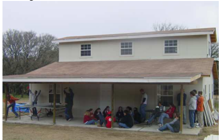
St. Thomas More Teens during service project on Eagle's Nest.

Eagle's Nest is our first retreat facility being built. It is a 36'x36' building with a 12'x36' sleeping loft and front & rear covered porches. The building contains 2 bathrooms, a small kitchen & large meeting area.