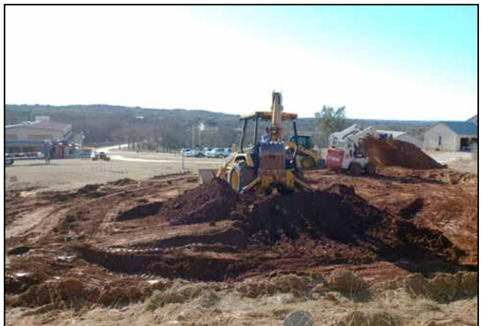
Site prep for the new Chapel